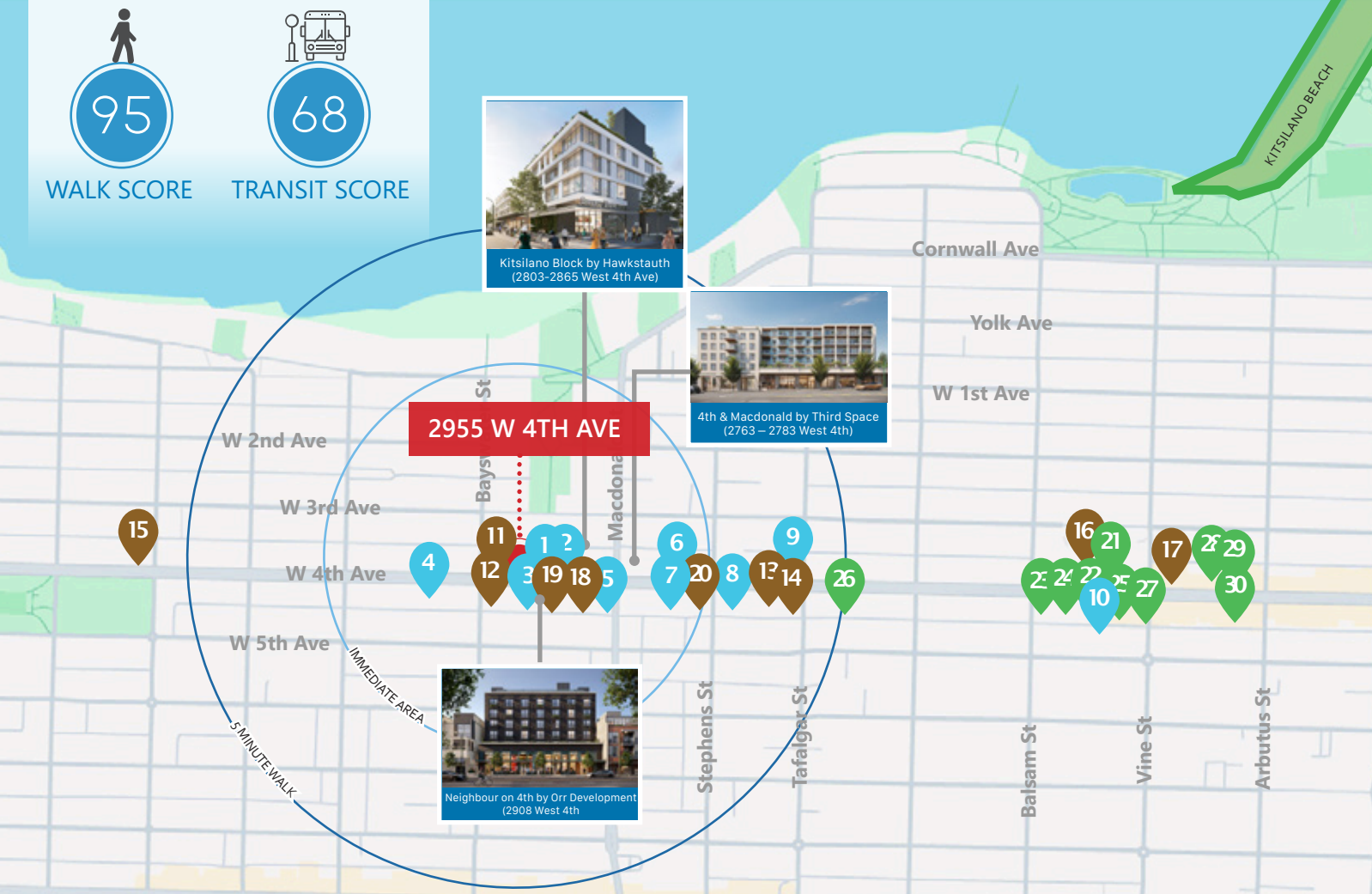
Neighbour on 4th by Orr Development (2908 West 4th)