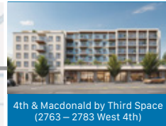
4th & Macdonald by Third Space (2763 - 2783 West 4th)