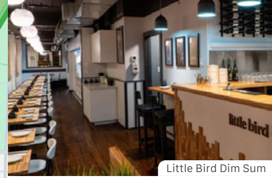
Little Bird Dim Sum